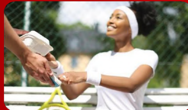
⑤ Pay for anything