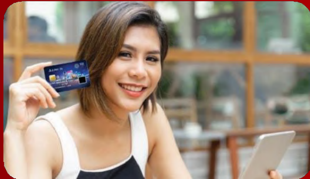
① Have a bank card