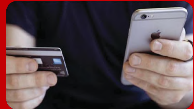
③ Add wearable and card to tokenization app