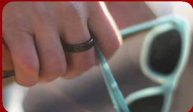
④ Link and load your card